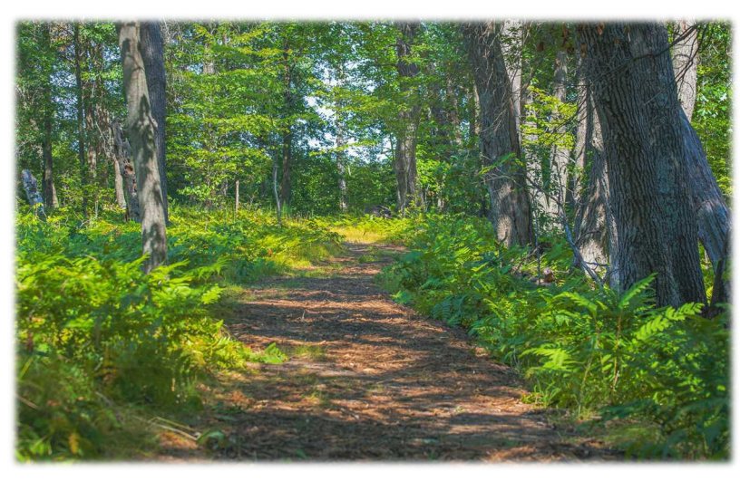
Pacem trail through the woods.

"I came here with the intention to cultivate more self-compassion and an attitude of surrender. This environment created the space and conditions to do so. I feel so nurtured and held while here, while in solitude. It's truly a gift.